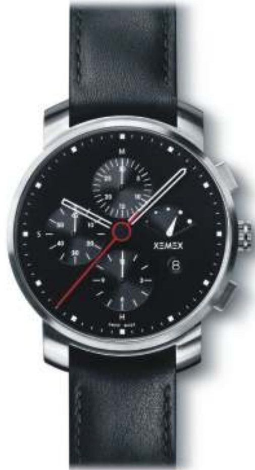
Ref. 8706.01/Chronograph Reserve Case: 40 mm, brushed, stainless steel, sapphire crystal, water resistant to 50 m. Movement: Soprod SD 7756. Limited Edition.