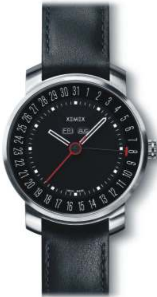
Ref. 8406.01/Day to day Case: 43 mm, brushed, stainless steel, sapphire crystal, water resistant to 50 m. Movement: Soprod DD 9000. Limited Edition.